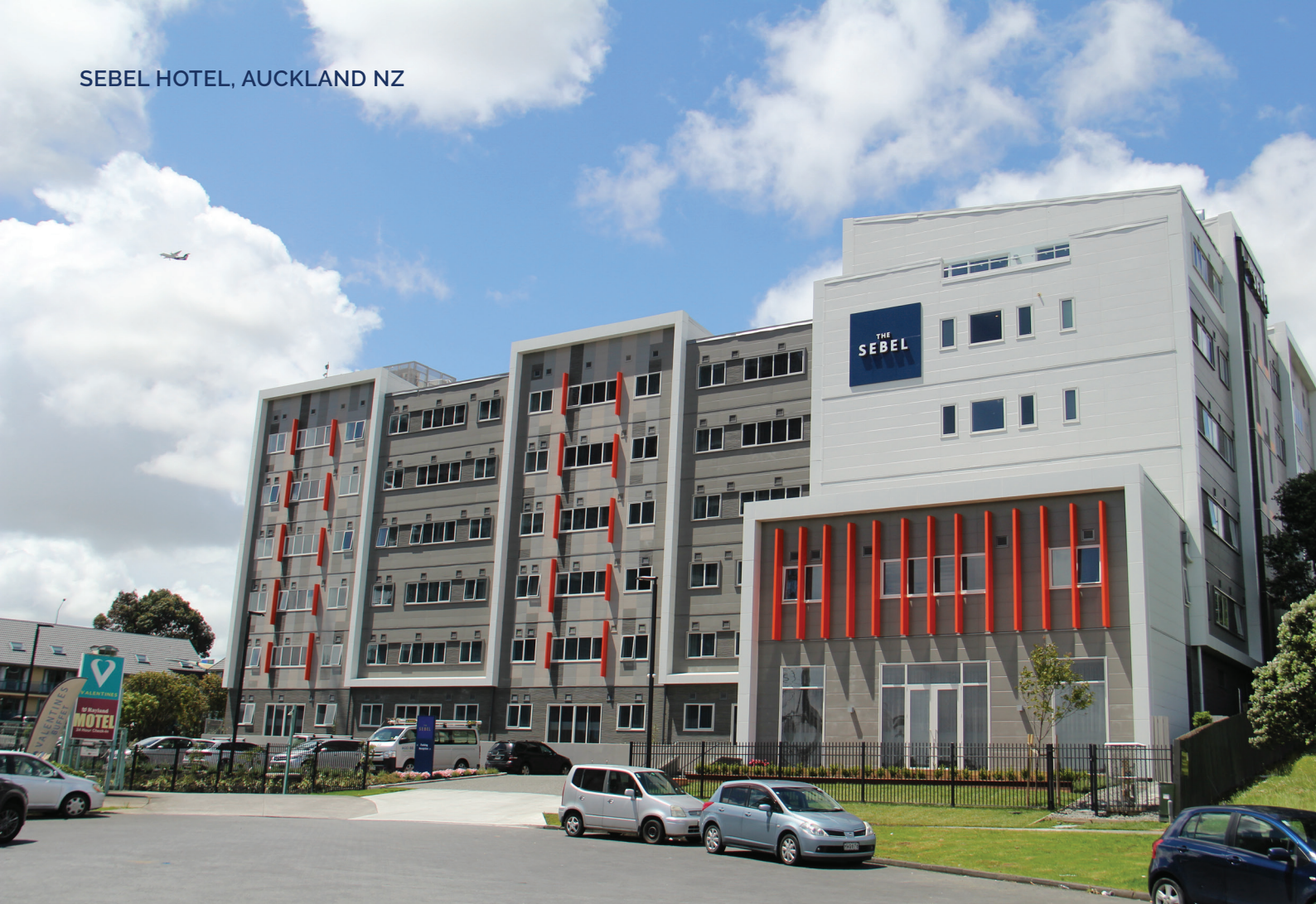
SEBEL HOTEL, AUCKLAND NZ